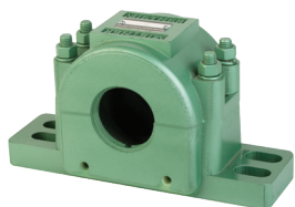
Miether Pillow Block