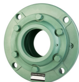
Piloted Flange Cartridge Bearing Housing