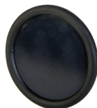
Seal End Cap EPR