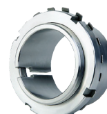
Adapter Sleeve - CC